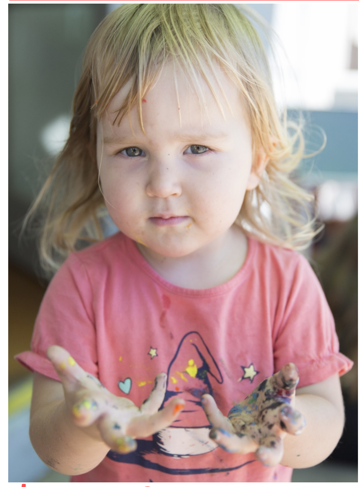
$100 from your